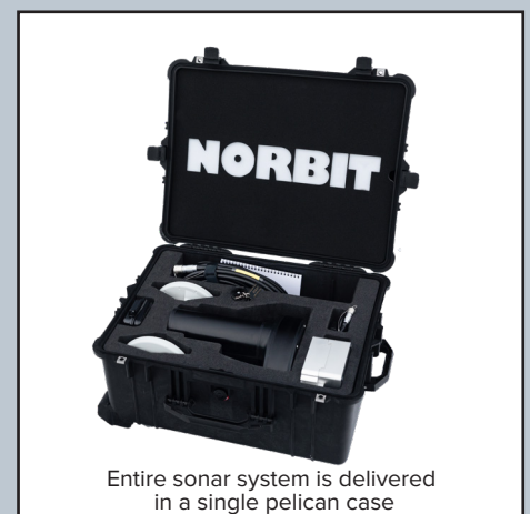
Entire sonar system is delivered in a single pelican case